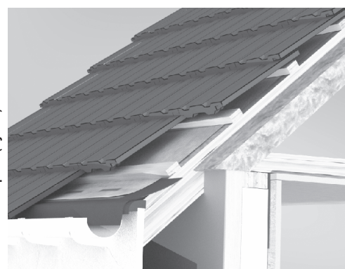
Habitable roof space (hybrid)